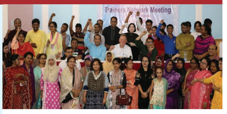
All participants in the May 4th Trainers Network Meeting

OHS workshops. The five groups reported on their conclusions to the entire assembly to draw out the lessons learned from two years of activity.