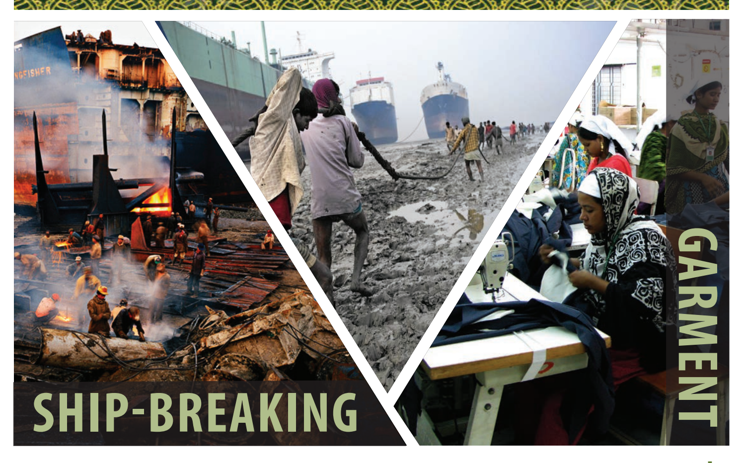
These workers in Bangladesh need the OHS Initiative for Workers and Community!