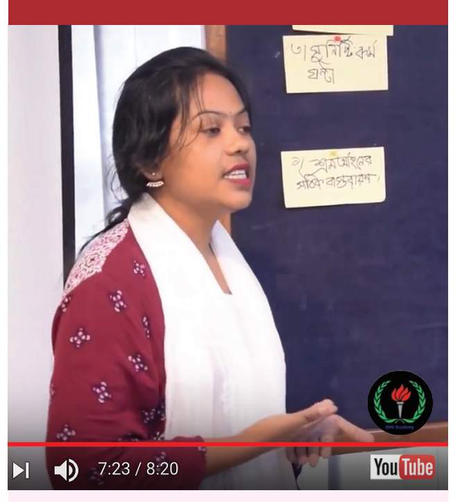
A YouTube video makes available to all a session on trade unions led by BILS as part of the 2018 Training-of-Trainers course.

The OHS Initiative has produced and posted 19 short documentary videos on YouTube, now available online worldwide. The Initiative launched the YouTube page in May 2018 and more than 575 people visited the on-line site in the first four months. The videos contain sections of the trainers' presentations and recommendations, as well as the participants' activities and feedback. Watch the videos by typing "OHS Initiative for Workers and Community" in the YouTube search engine.