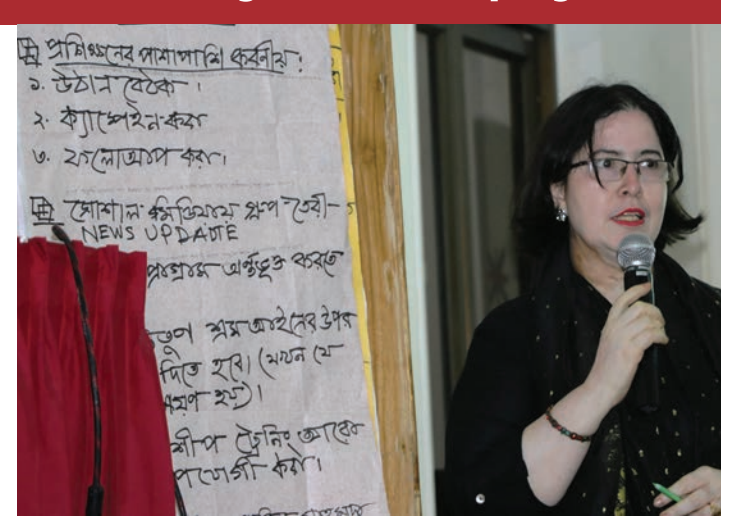
Trainer reports on her small group's discussion on how to make community-level OHS workshops more effective

The first two years of the Initiative have yielded 54 trainers (five trainers dropped out due to job changes and related issues) who have conducted more than 200